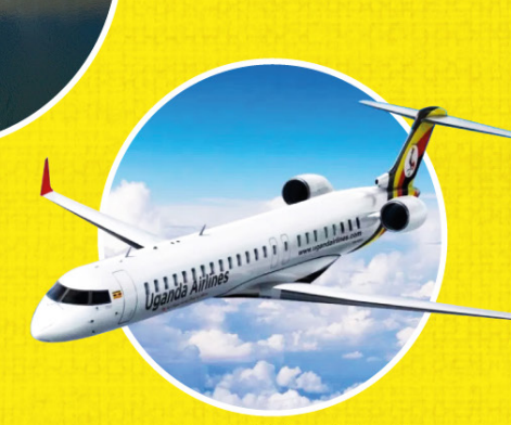
Uganda Airlines is back!

You can now easily fly to Kenya, Tanzania, Rwanda, Zanzibar, S. Sudan, Zambia, DRC and South Africa.